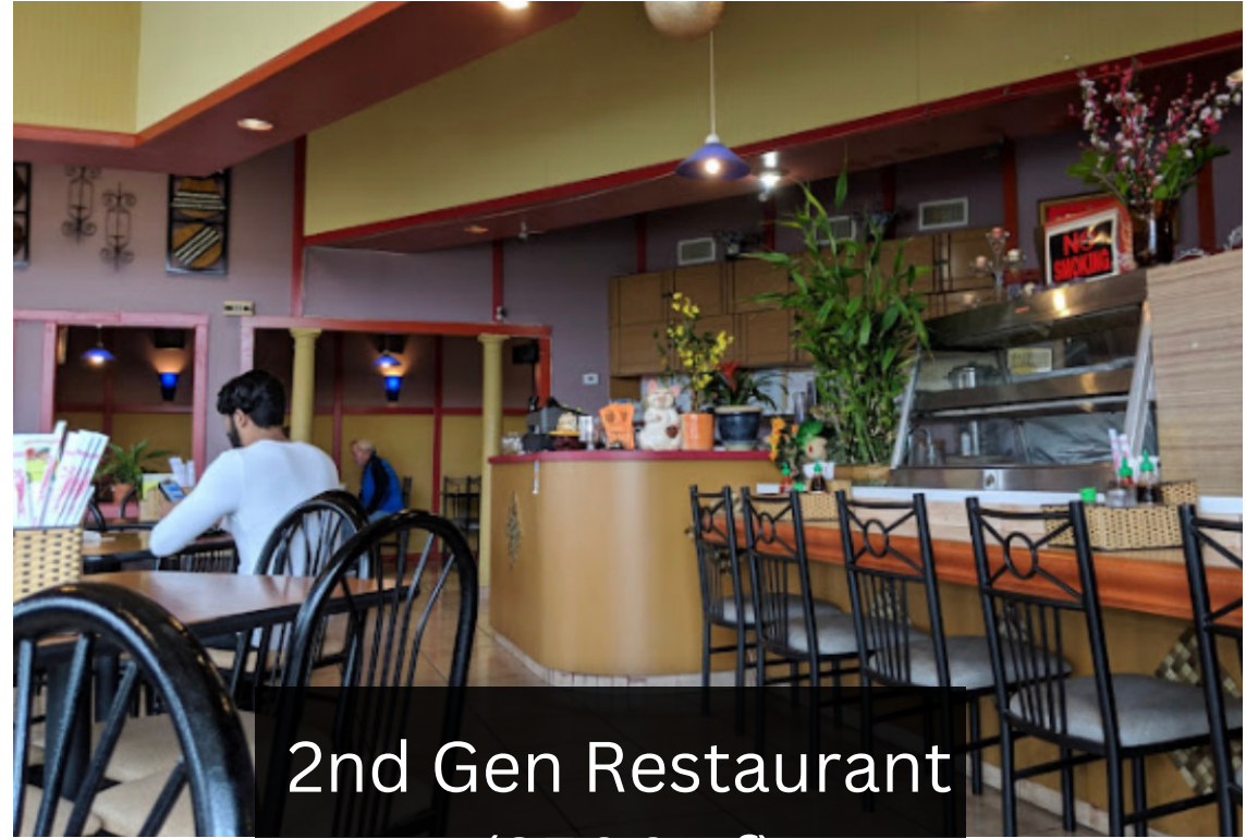
2nd Gen Restaurant (2500 sf)